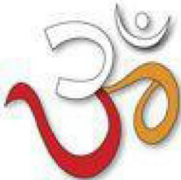
Fig.3 Symbol of OM

This symbol is adopted by Tripathi to indicate the puranic stature of the archetypal hero Shiva. This indicates a man with the crown of bull horns surrounded by grazing cattle and weapons of various dimensions and intensities.