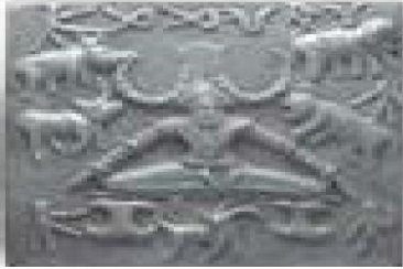
Fig.2.The seal excavated from the Site of Harappa Civilization

evil from the face of earth. These symbols were used by Tripathi to symbolize the attributes of the puranic hero.