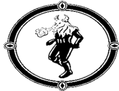
Fig.4 bagavatgitausa (Shiva's fury, Daksha)

valiant and orderly. White colour refers to the moon which is cool, careworn waning and waxing. Both indicate Suryavanshi and Chandravanshi way of life. The symbol Om also refers to the inclusive way of life.